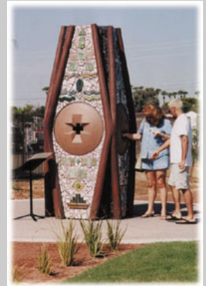
Elsie McCarthy Sensory Garden

7637 N. 55th Ave. Located south of Northern Avenue on 55th Avenue