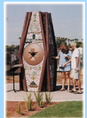
Elsie McCarthy Sensory Garden