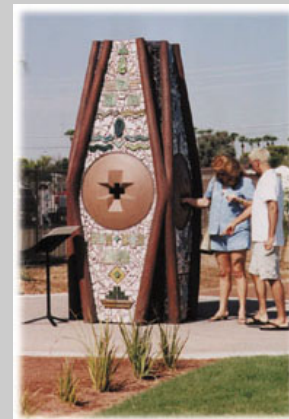
Elsie McCarthy Sensory Garden 7637 N. 55th Ave. Located south of Northern Avenue on 55th Avenue

The Elsie McCarthy Sensory Garden was developed to stimulate the senses of sight, sound, smell and touch. Through the use of specific plants and trees for texture and scent, water features for sound, touch and sight and evening lighting for dramatic visuals, this garden is one of Glendale's proudest locations.