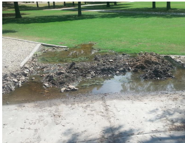
As Monsoon Rains Continue, Glendale Gives Tips to Safeguard Against Mosquito-borne Illnesses