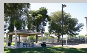
Rose Lane Park 51st Avenue and Marlette Avenue