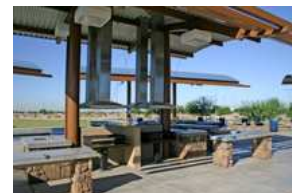
Parks & Recreation Ramada Rentals