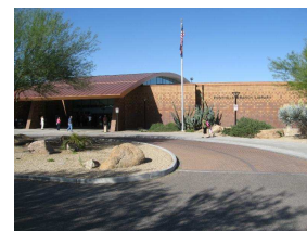
Foothills Branch Library